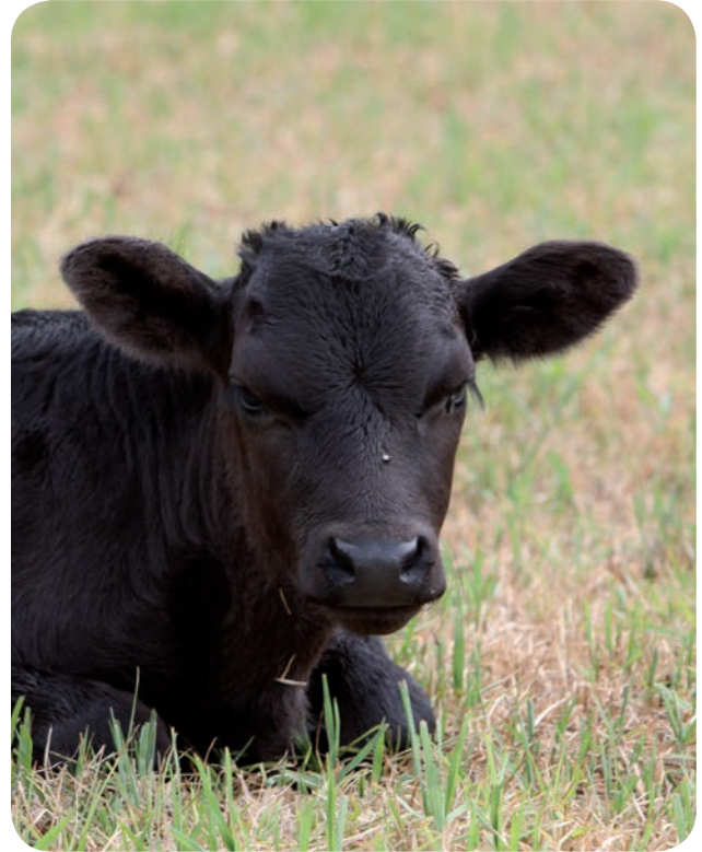
Becker, J., Doherr, M.G., Bruckmaier, R.M. et al. (2012) Acute and chronic pain in calves after different methods of rubber-ring castration, The Veterinary Journal , 194 : 380–385.

The researchers found that the three ring method caused the greatest amount of swelling and pain to the calves. Their discomfort was so great that the rings had to be removed before the end of the study. Calves of group (iv) showed not only the least signs of pain in the days following the application of the ring, but also the fastest rate of wound healing. The authors recommend this treatment as it significantly reduces the risk of infection and improves the welfare of the calves.