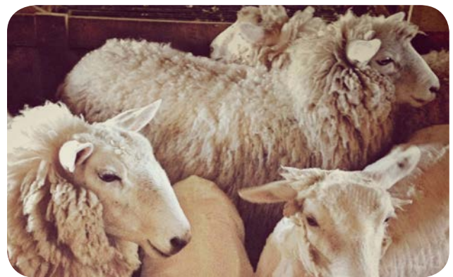
Caulfield MP, Cambridge H, Foster SF et al (2013) Heat stress: A major contributor to poor animal welfare associated with long-haul live export voyages. The Veterinary Journal (In press).

The authors express concern that the currently used model does not take into account the impact of high temperatures on animals shipped from Australia to the Middle East during the Northern hemisphere summer and may not accurately protect the animals from poor welfare. The authors call for data from all voyages to be published so that the risk assessment model can be assessed by an independent scientific body.